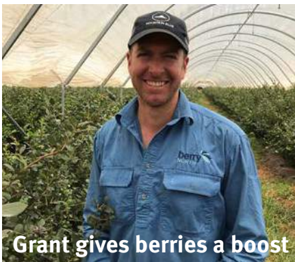
Grant gives berries a boost

Funding for a sixth round of RED Grants has been allocated for the 2023-2024 financial year which will include a focus on supporting Indigenous-owned agribusinesses and projects aimed at low-emissions agriculture. Keep an eye on QRIDA's website and social media channels for details about when the next round of grants will open.