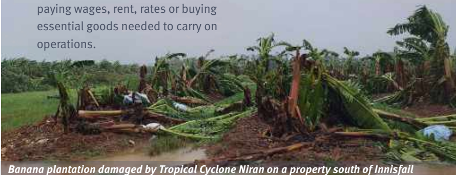
Banana plantation damaged by Tropical Cyclone Niran on a property south of Innisfail

QRIDA administers this financial assistance under the joint Commonwealth / Queensland Government funded Disaster Recovery Funding Arrangements 2018.